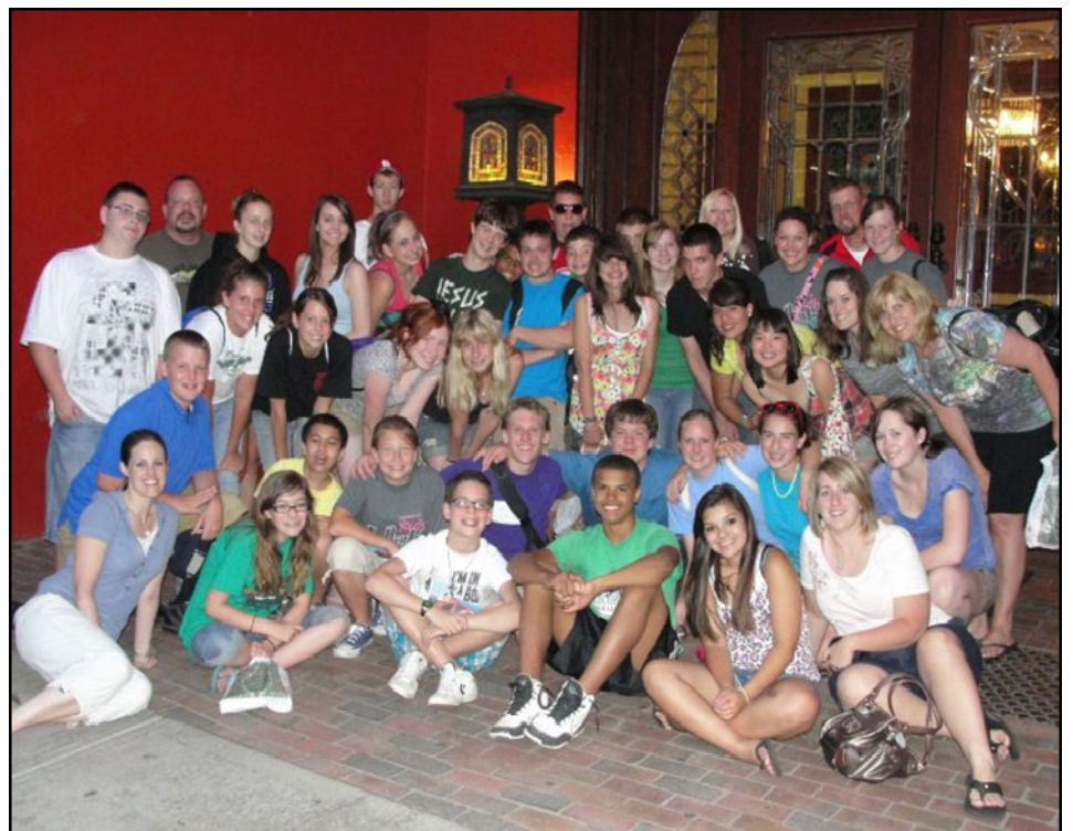
Our group enjoying a night together at the Old Spaghetti Factory downtown Denver.

"Do nothing out of selfish ambition or vain conceit, but in humility consider others better than yourselves...your attitude should be the same as that of Christ Jesus" -Phil. 2:3-5