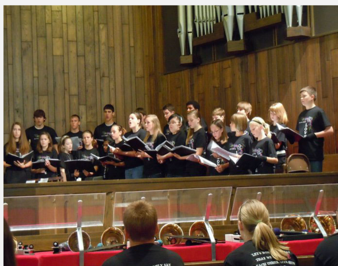
Young Christian Singers sing "How He Loves Us."